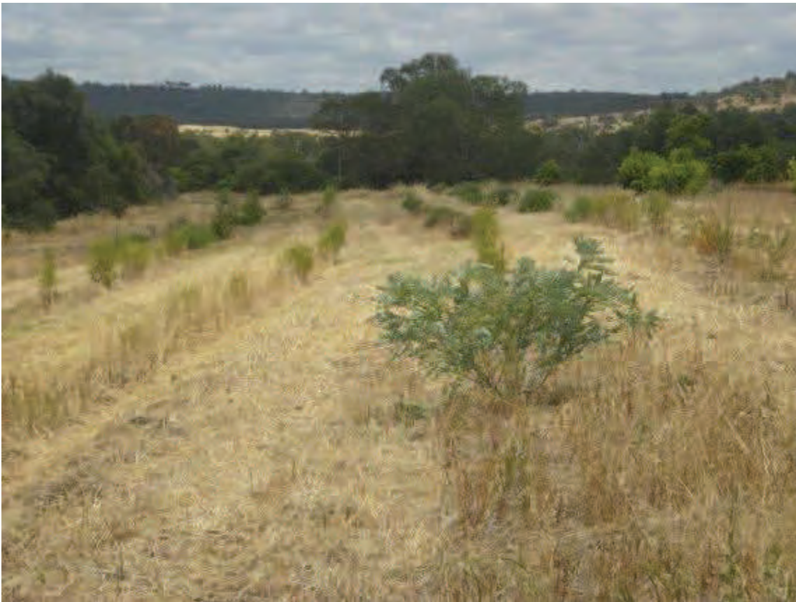
Top: Machinery taking off the weeds in the reserve opposite Millards Pool.