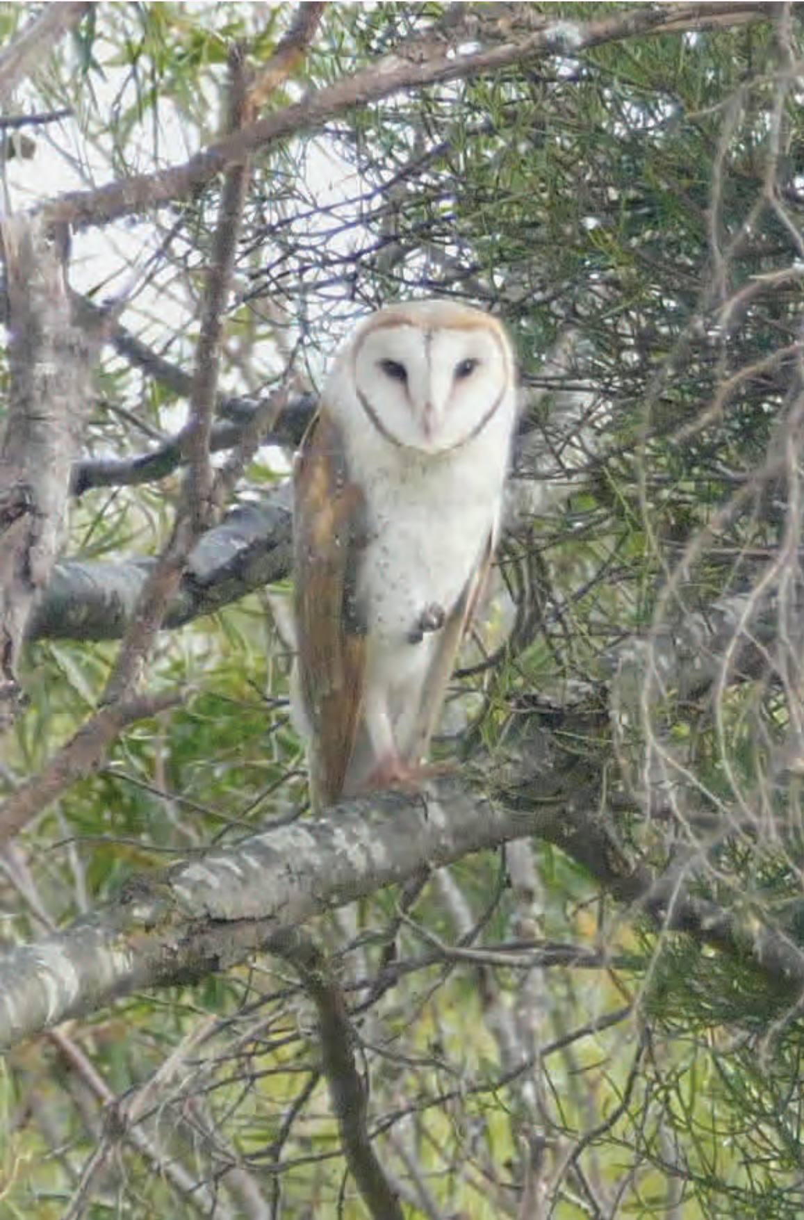
Left: a Barn Owl poses for the camera.